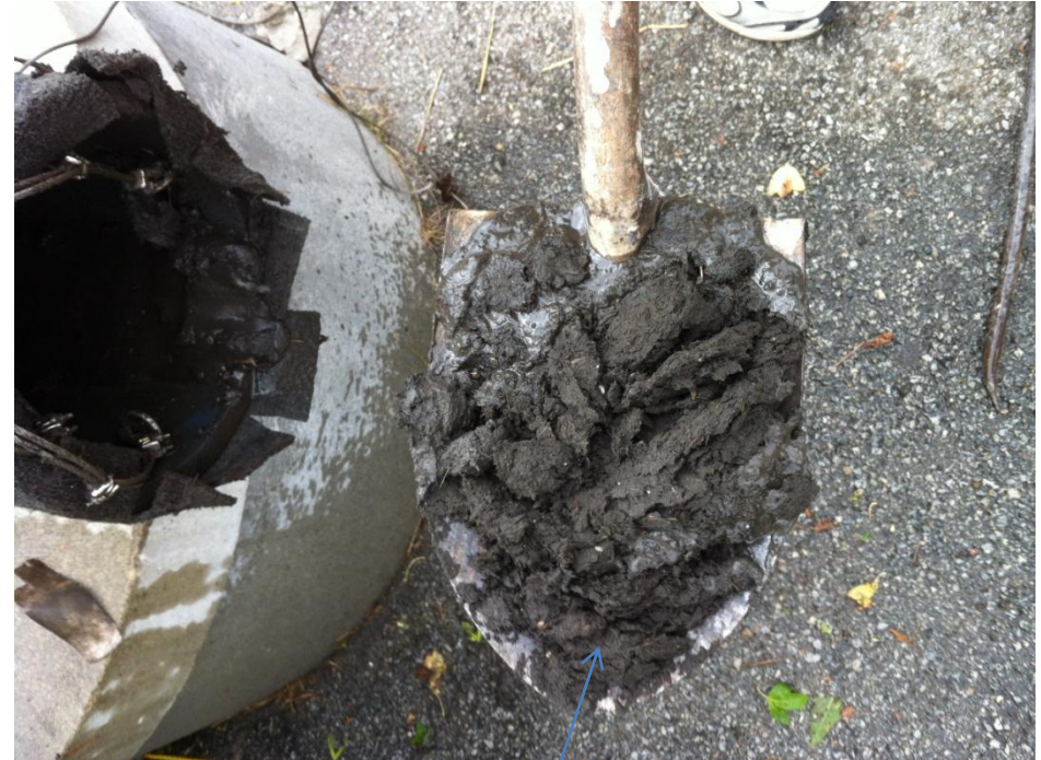
Sludge Collected that did not reach river