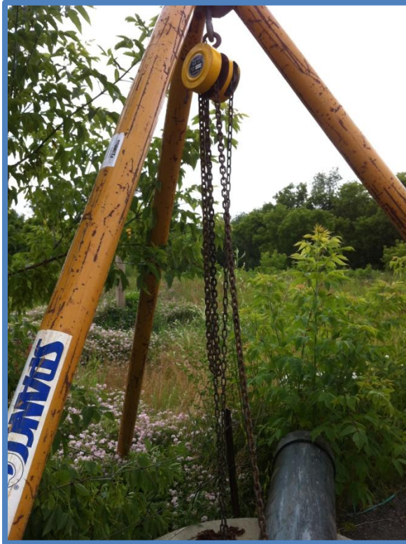
SAGES™ being removed